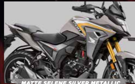
MATTE SELENE SILVER METALLIC